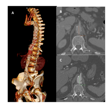
Fig. 2 Three-dimensional computed tomography (CT) reconstruction in lateral view showing the correct deployment of both thoracic and abdominal aorta, the femoro-femoral crossover bypass patency, and the residual posterior penetrating aortic ulcer (PAU) of the visceral aorta (A). Visceral aortic PAU of 30 mm at the first CT scan (B), increased to 36 mm at the last CT scan (C).

The patient was submitted to a strict follow-up to exclude complications and to monitor the size of the remaining PAU at the level of the visceral aorta. Three months after the last operation, a CT scan control showed the correct deployment of both thoracic and abdominal endoprosthesis, the regular patency of the crossover femoro–femoral bypass (Fig. 2A), and the increase of the PAU size from 30 to 36 mm (Figs. 2B and 2C). Thus, because of this very fast growth of the lesion, to prevent a sudden aortic rupture, the surgeon decided to cover this PAU using a multilayer stent (Cardiatis, Isne, Belgium), also able to maintain the visceral arteries patency and to prevent paraplegia, having already been covered a long tract of the aorta. The Cardiatis stent was deployed under